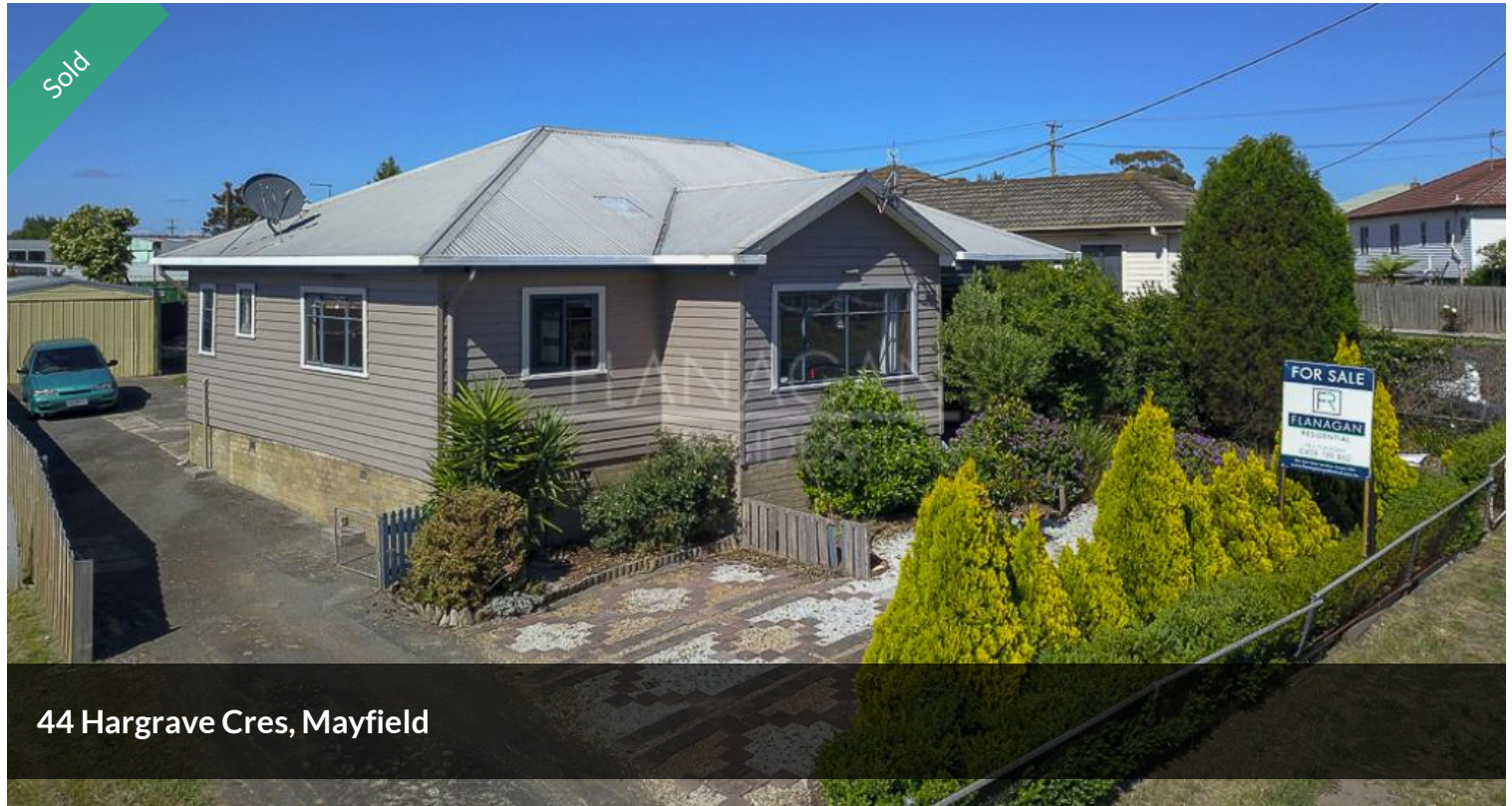
44 Hargrave Cres, Mayfield