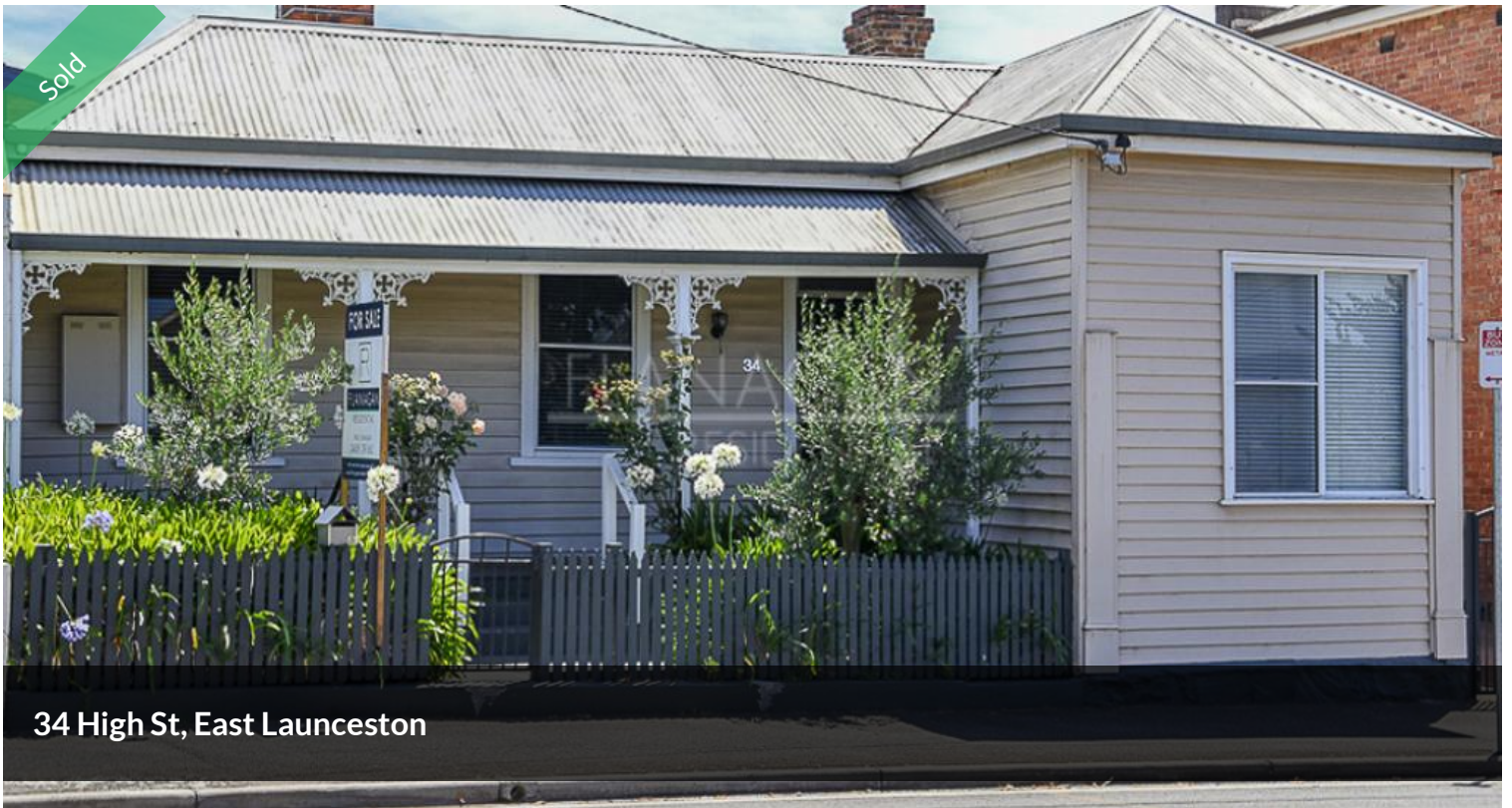
34 High St, East Launceston