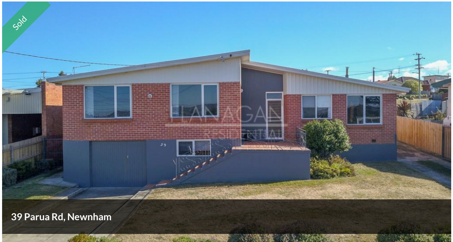
39 Parua Rd, Newnham