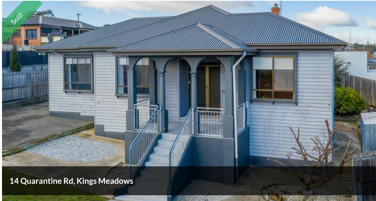
14 Quarantine Rd, Kings Meadows