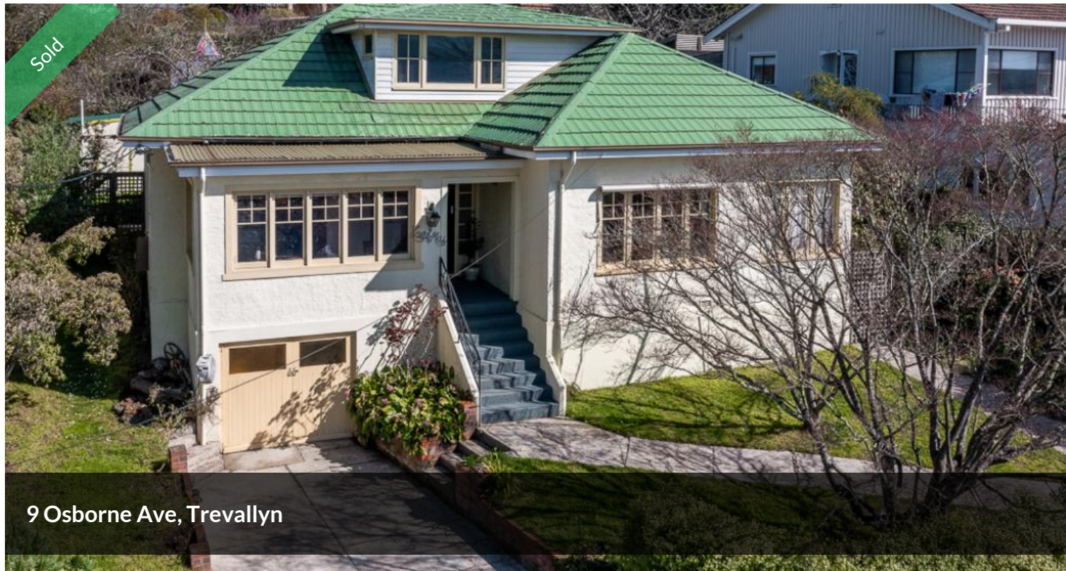
9 Osborne Ave, Trevallyn