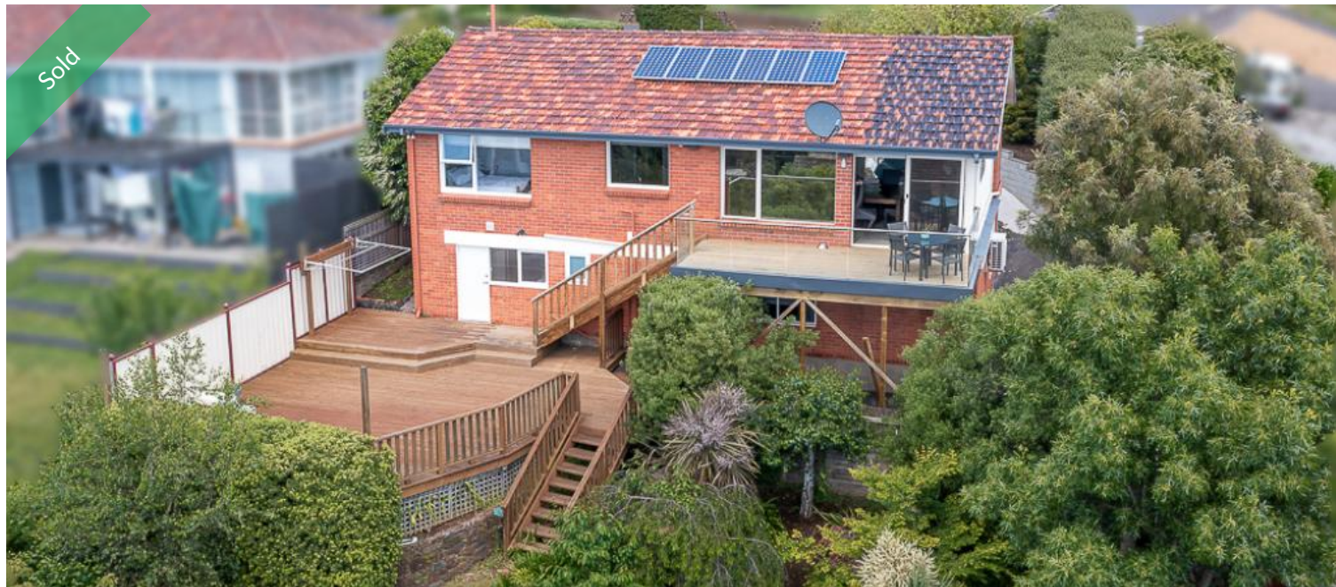
34 Broadview Crescent, Trevallyn