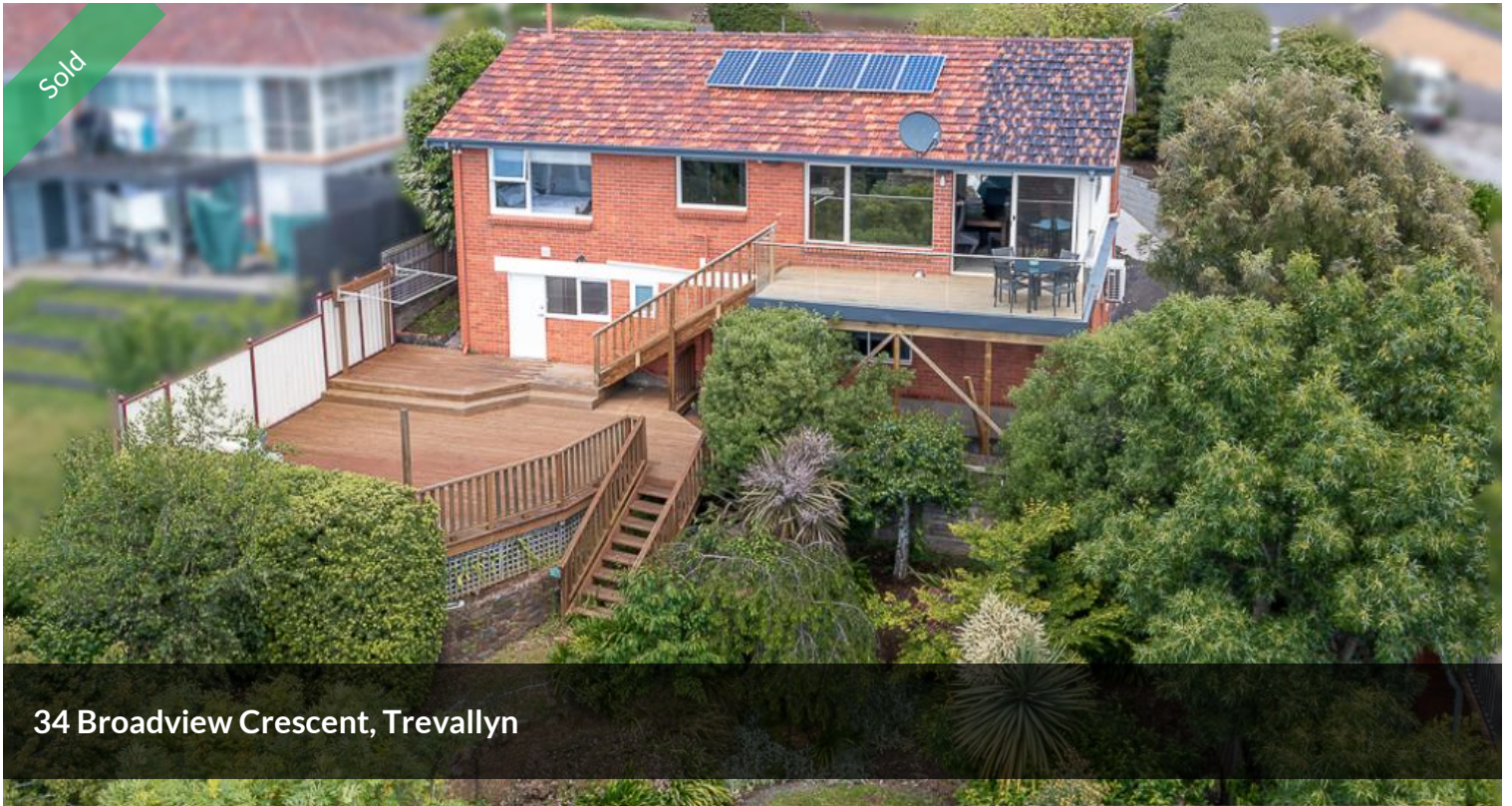
34 Broadview Crescent, Trevallyn