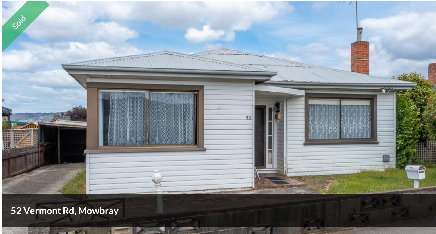
52 Vermont Rd, Mowbray