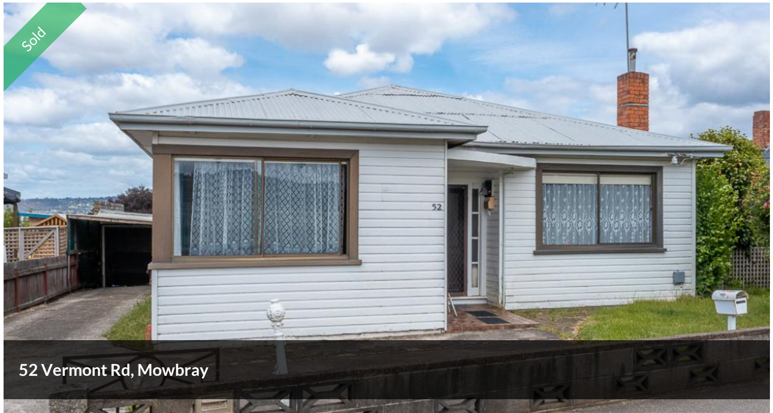
52 Vermont Rd, Mowbray