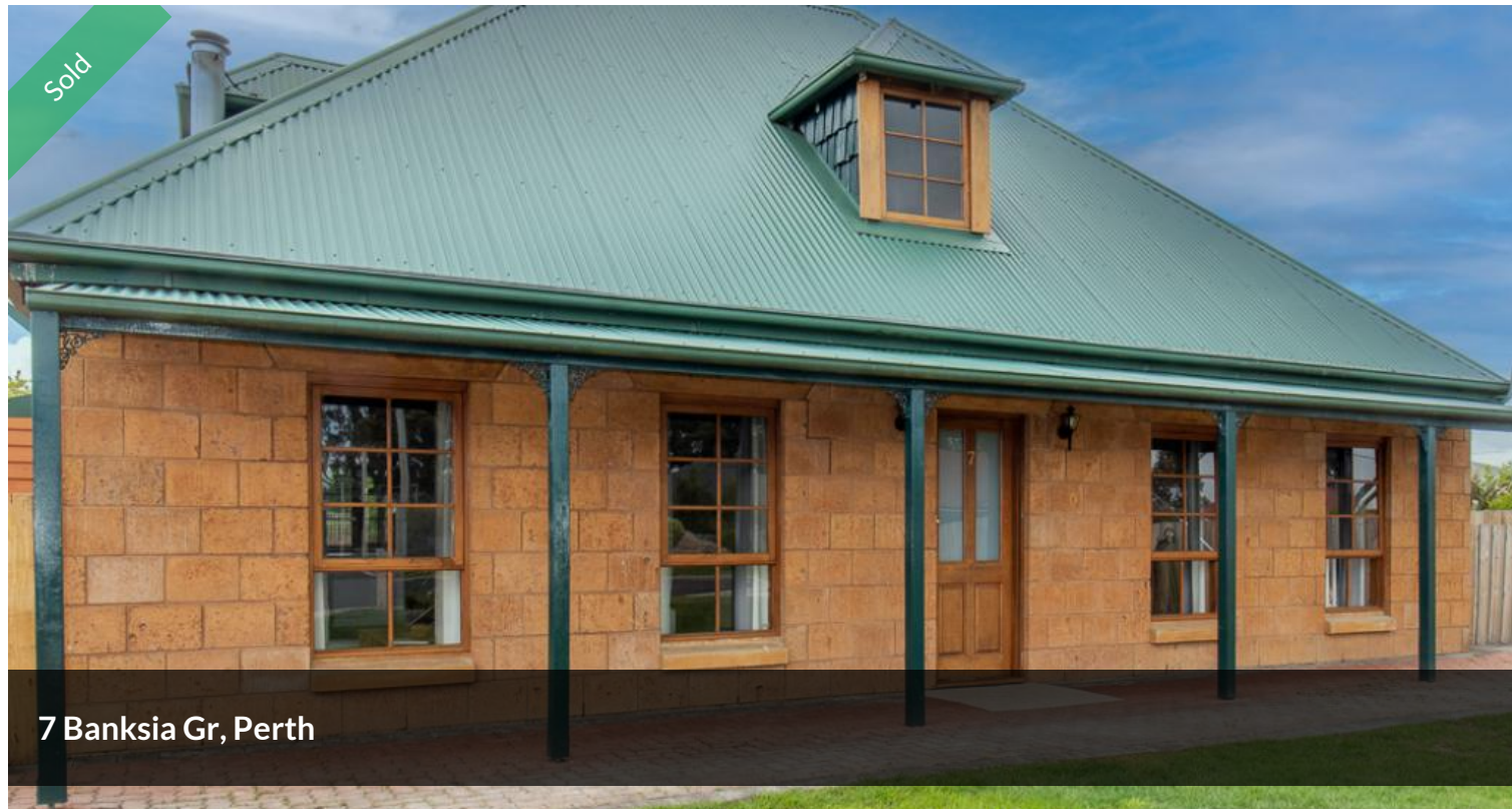
7 Banksia Gr, Perth