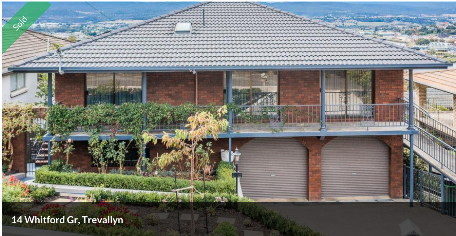
14 Whitford Gr, Trevallyn