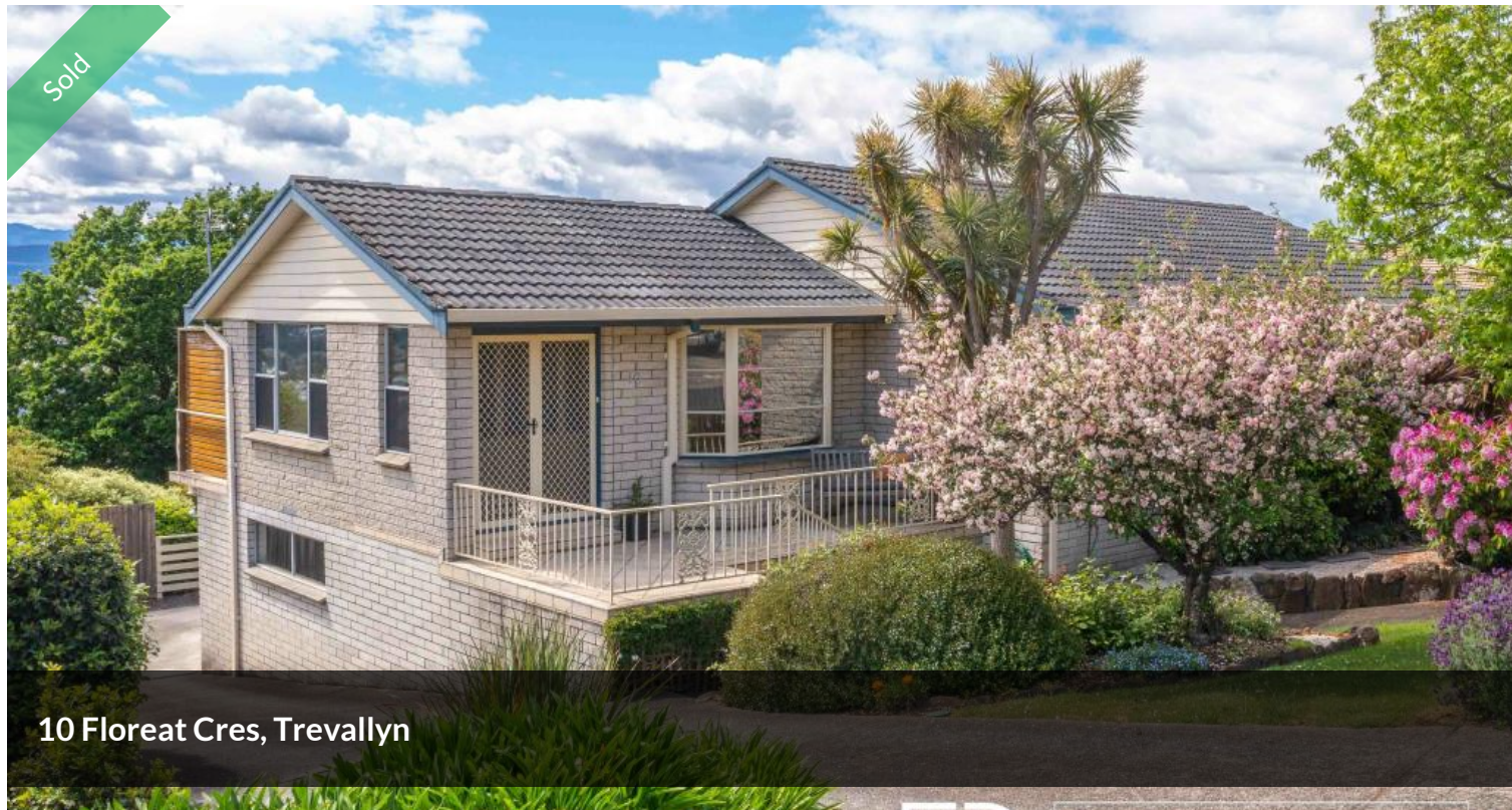
10 Floreat Cres, Trevallyn