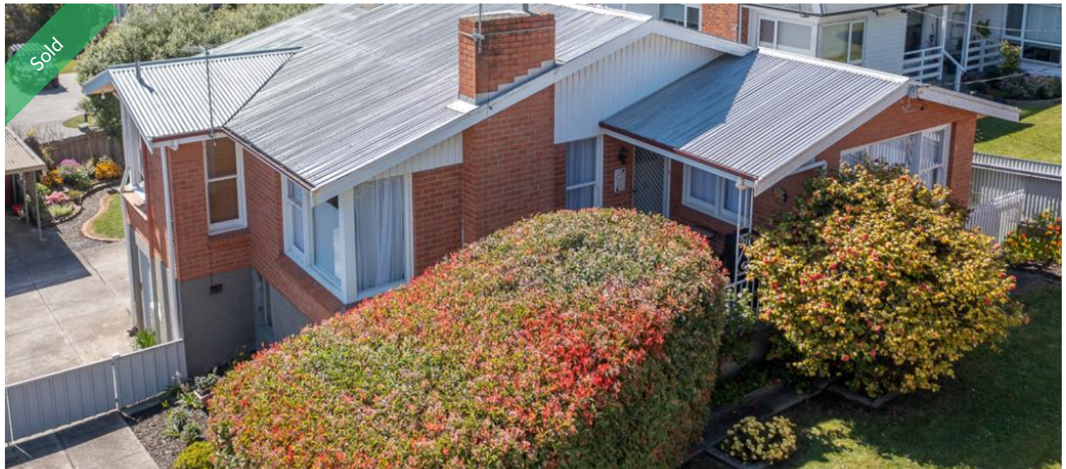
8 Prospect St, Prospect