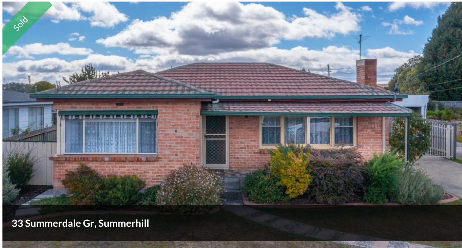
33 Summerdale Gr, Summerhill