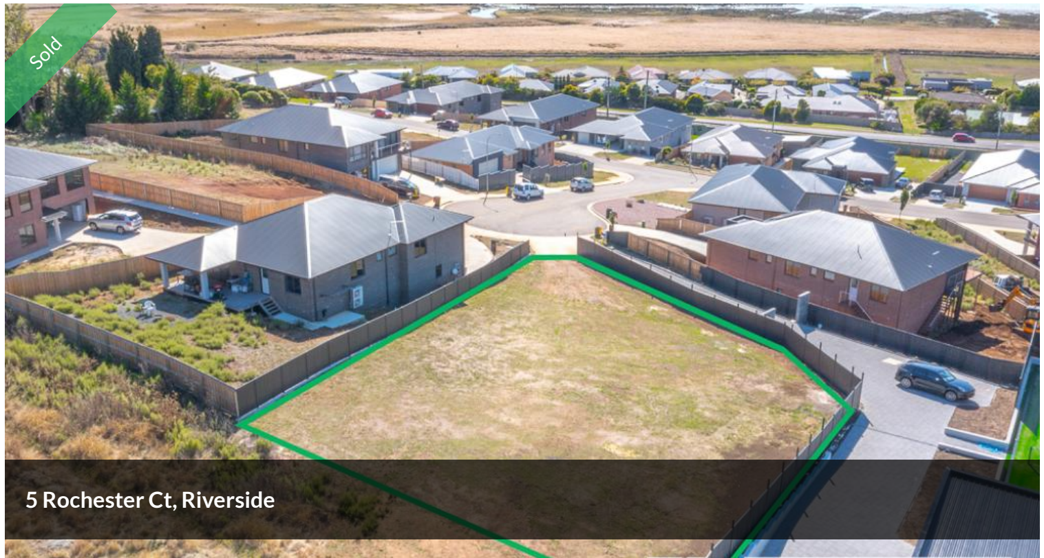
5 Rochester Ct, Riverside