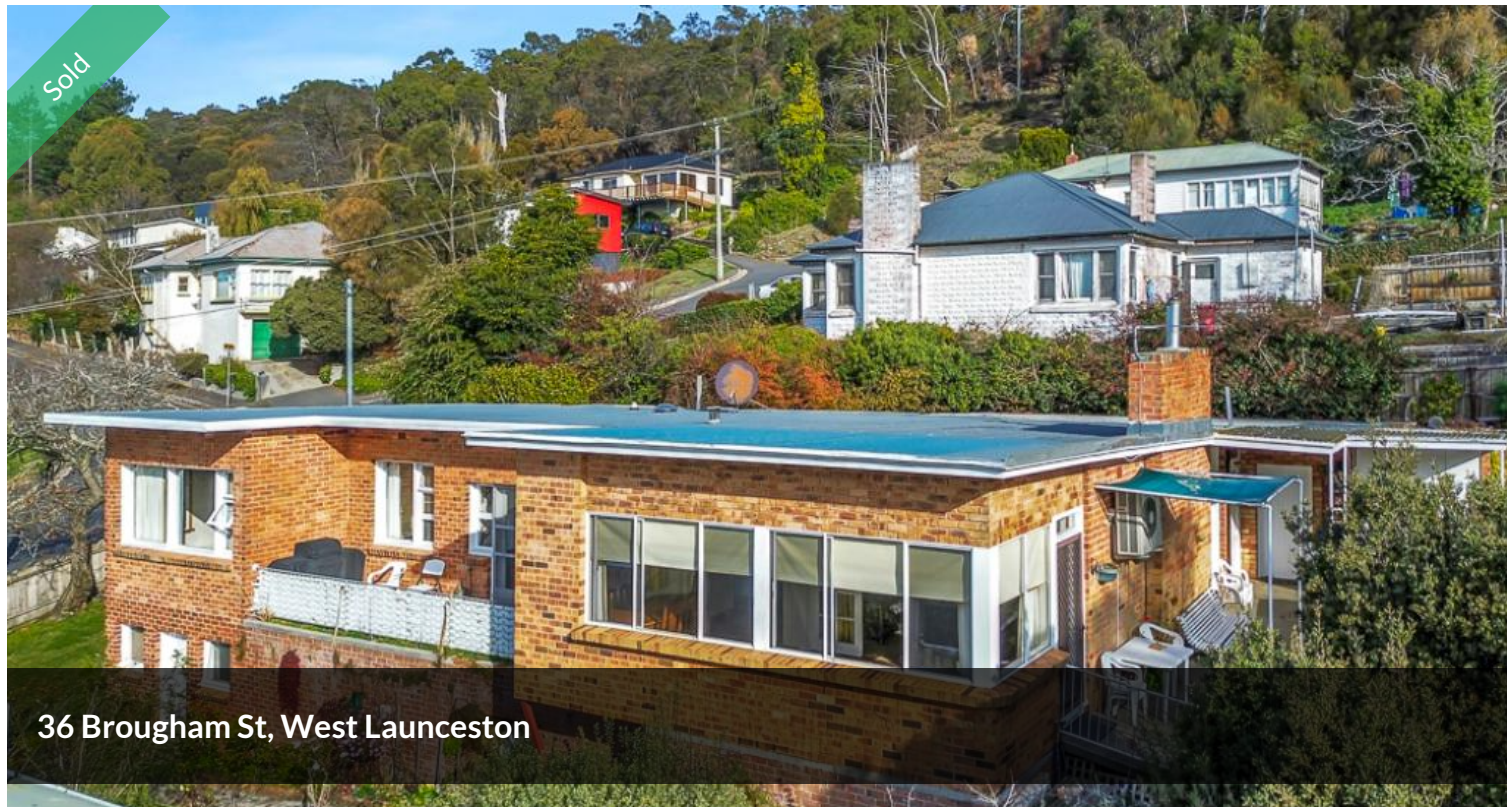
36 Brougham St, West Launceston