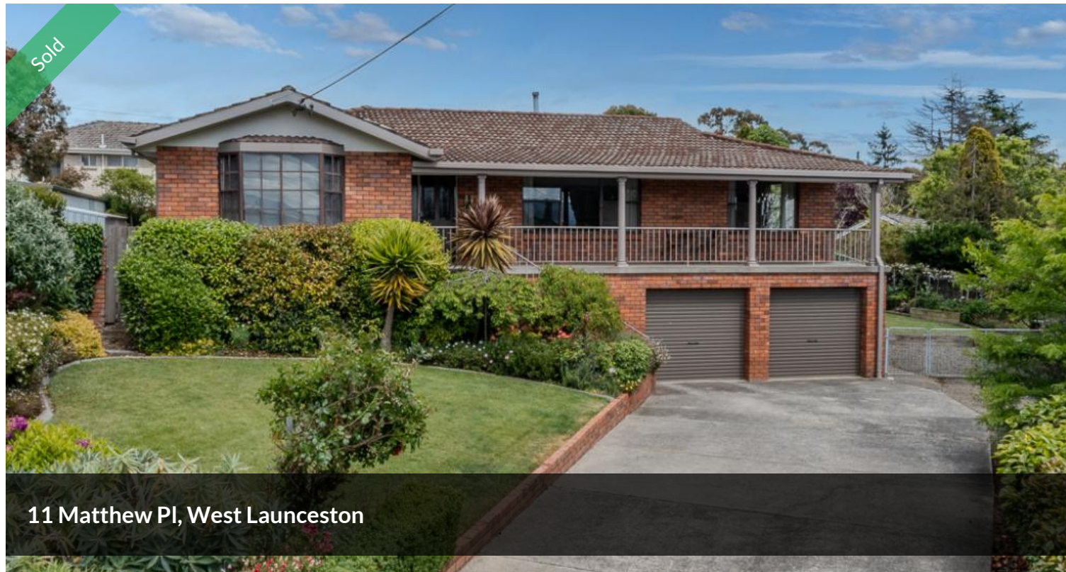
11 Matthew Pl, West Launceston