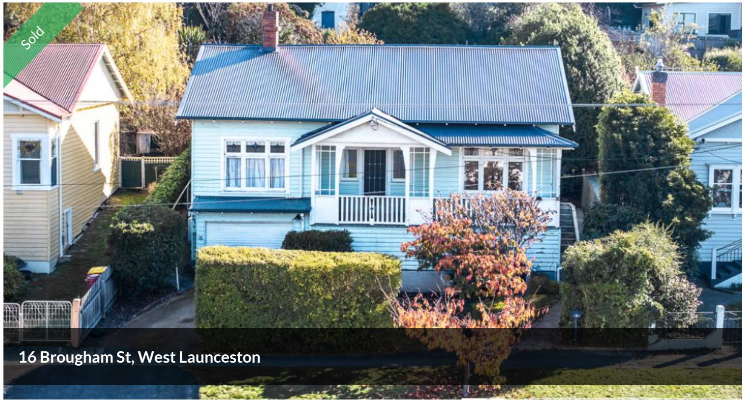
16 Brougham St, West Launceston