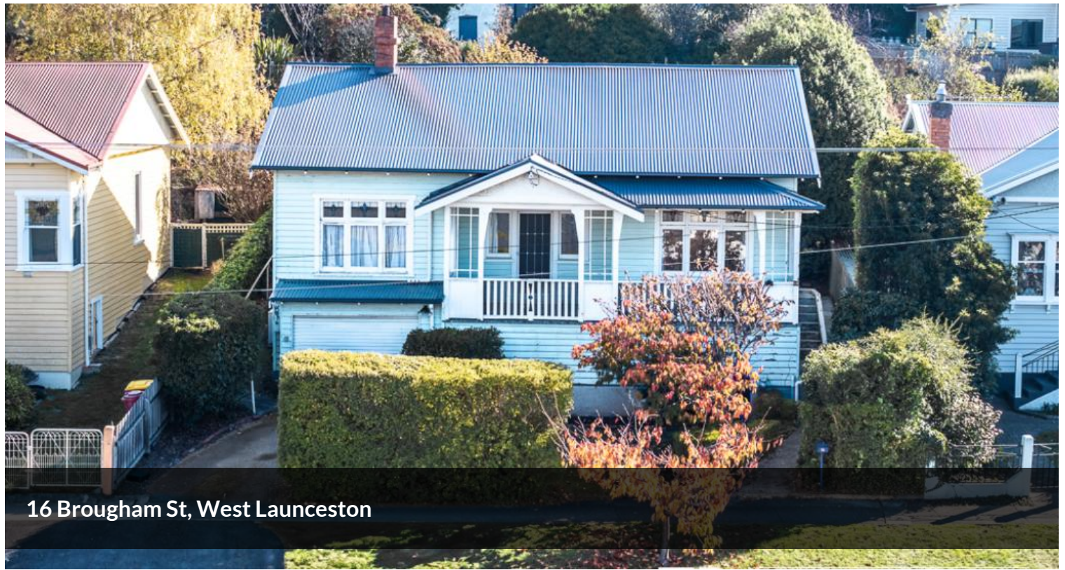
16 Brougham St, West Launceston