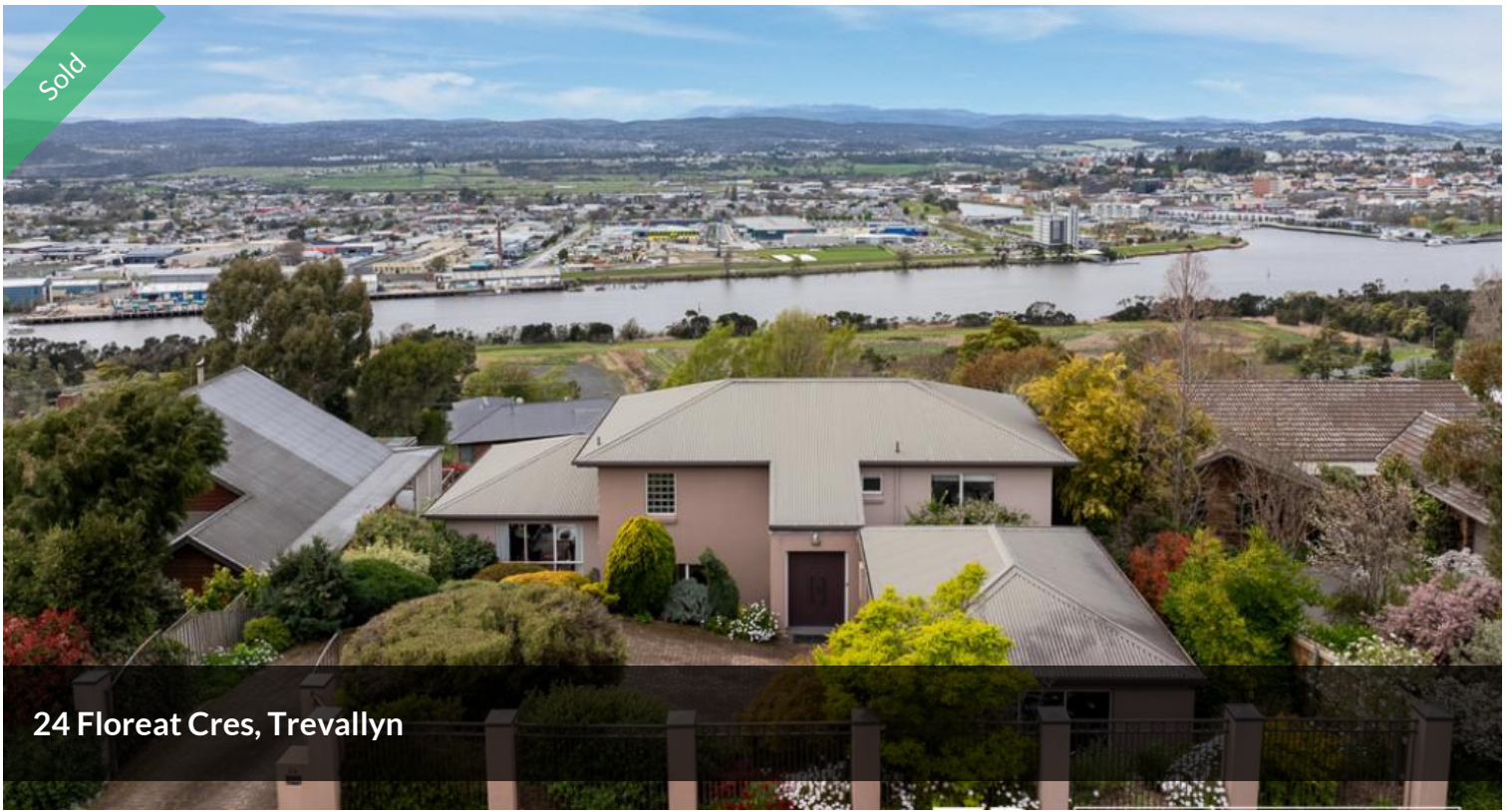
24 Floreat Cres, Trevallyn