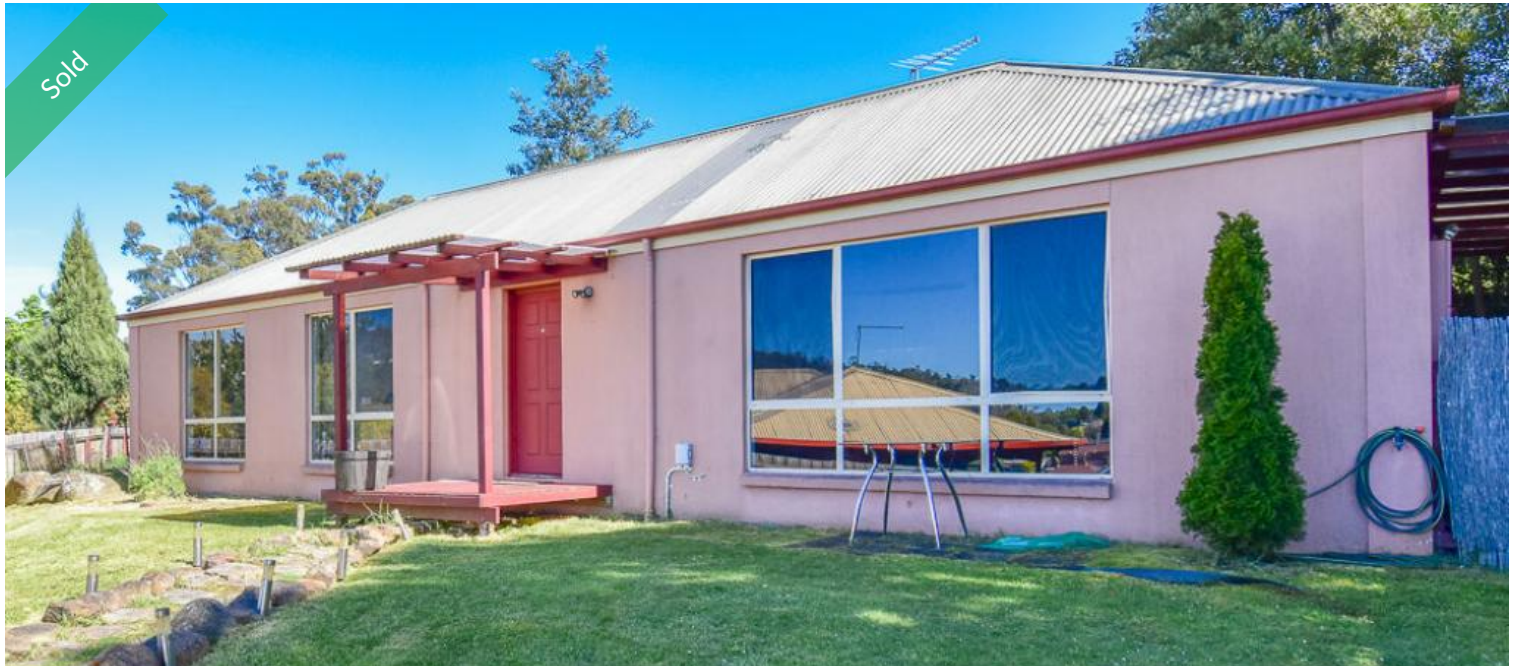
11 Glencoe Avenue, Trevallyn